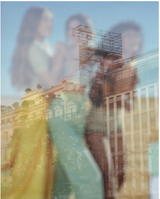
Fashion Advertisement, Champs-Elysées, Paris, 2021